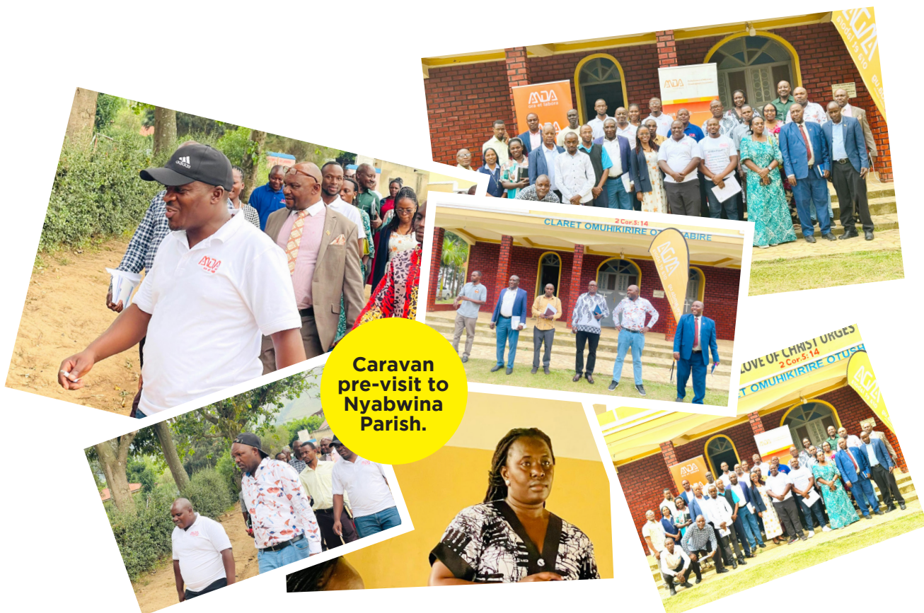
Caravan pre-visit to Nyabwina Parish.