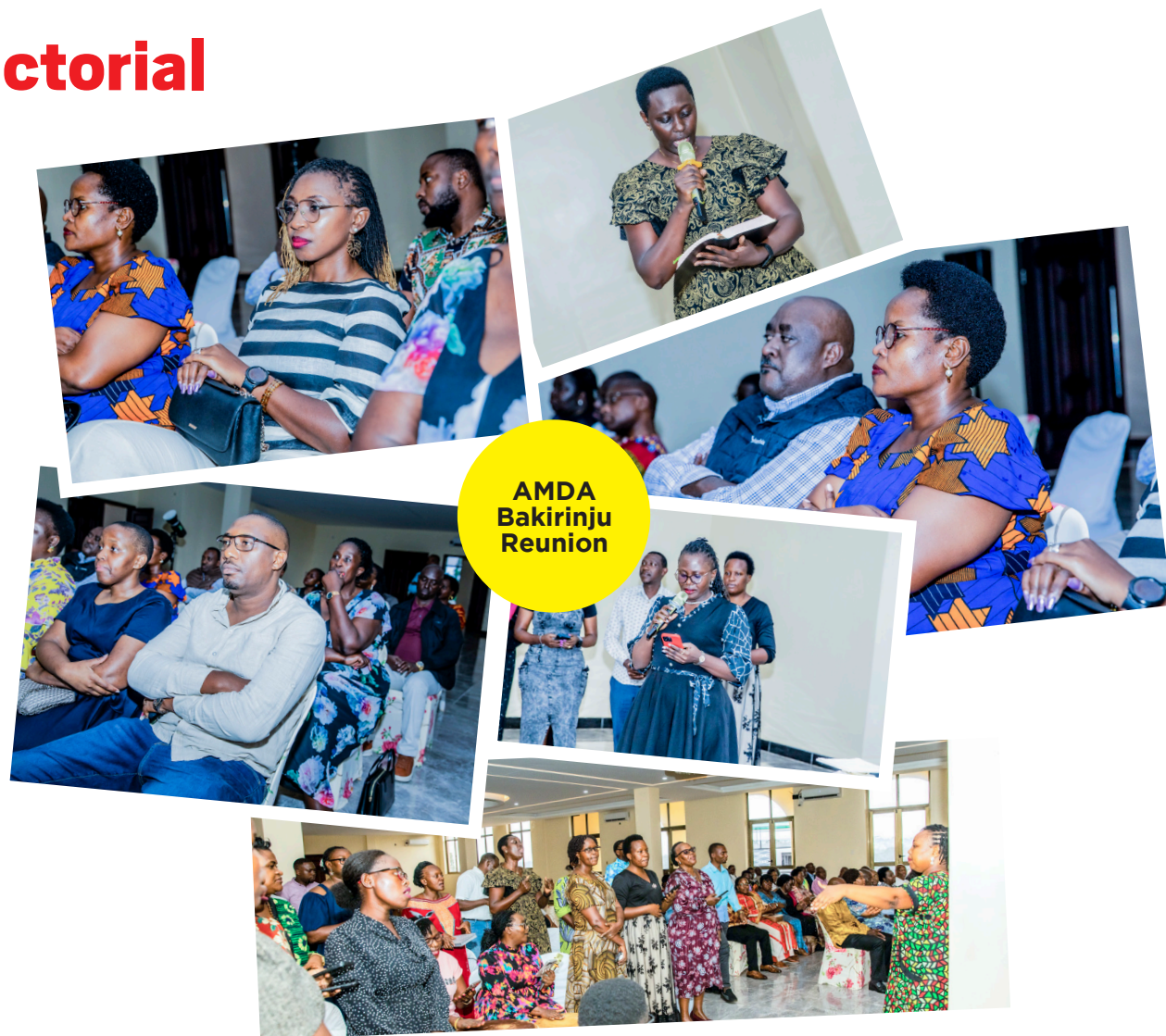
AMDA Bakirinju Reunion