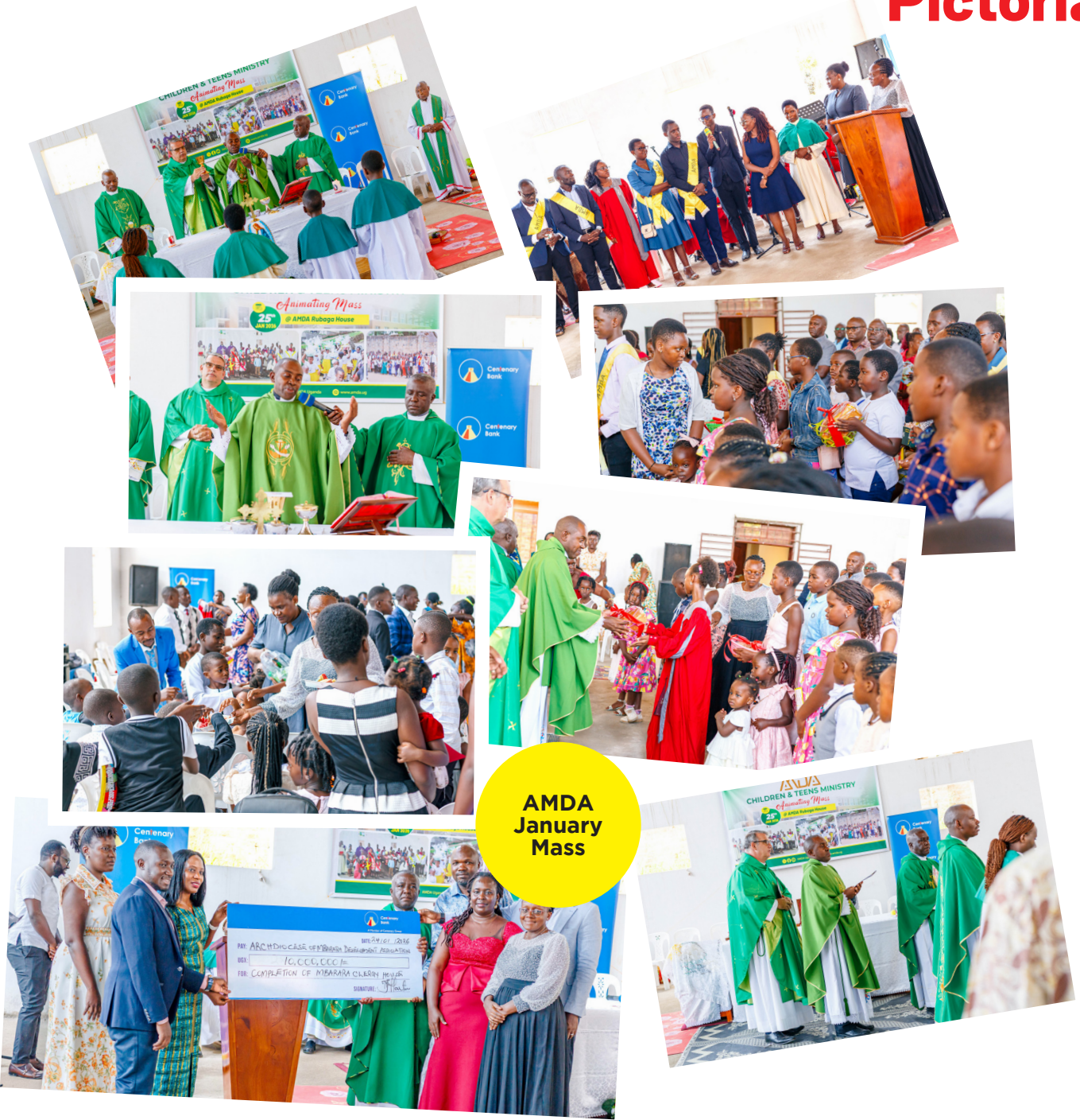
AMDA January Mass