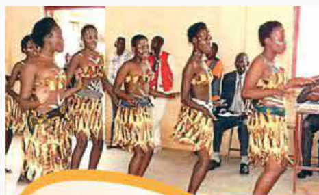
Students in Drama