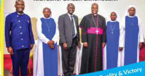
Quality & Victory