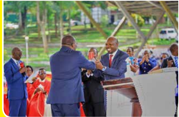
AMDA receives MEPA Candle

Archdiocese of Mbarara Development Association (AMDA)