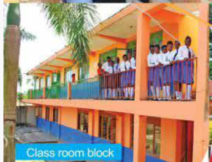
Class room block