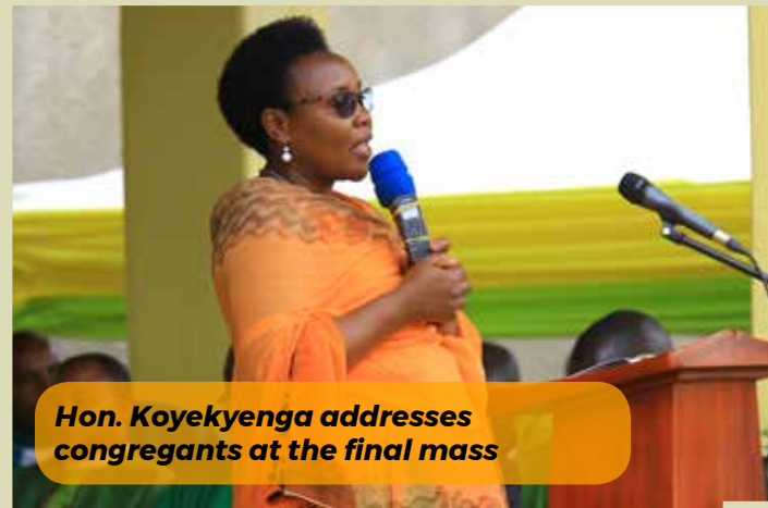
Hon. Koyekyenga addresses congregants at the final mass