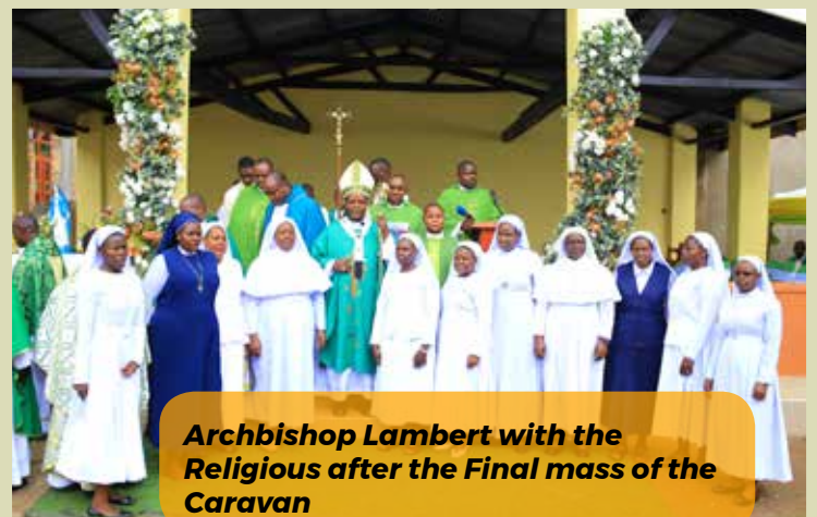
Archbishop Lambert with the Religious after the Final mass of the Caravan