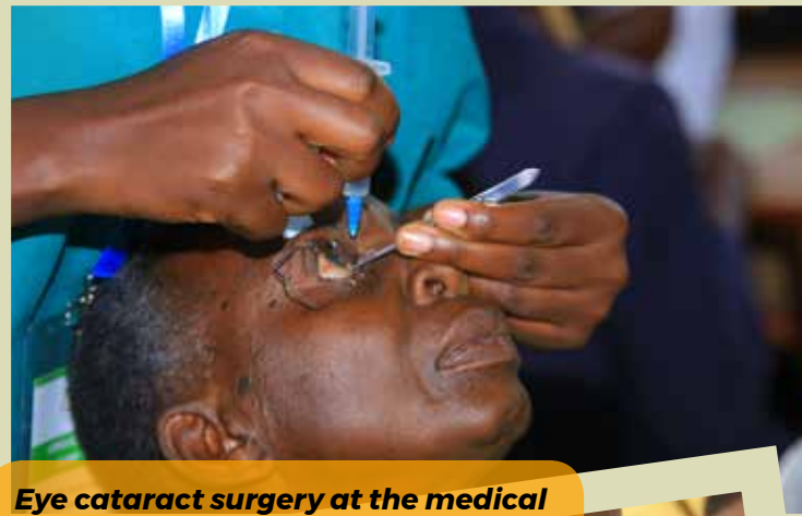
Eye cataract surgery at the medical camp