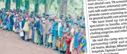
Buhweju residents line up for free health services during a camp at Butare Catholic Church at the weekend.

These numbers are a testimony that people become sick for years and later die for lack of healthcare," he said.