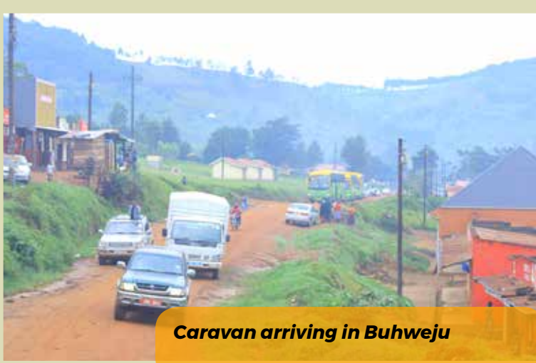
Caravan arriving in Buhweju