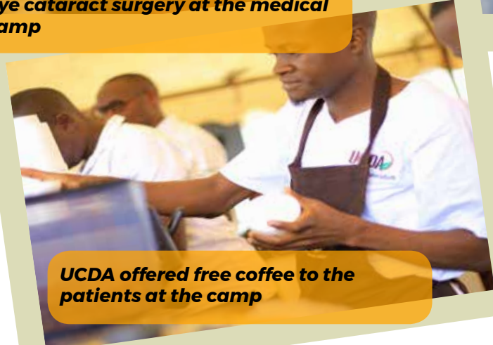
UCDA offered free coffee to the patients at the camp