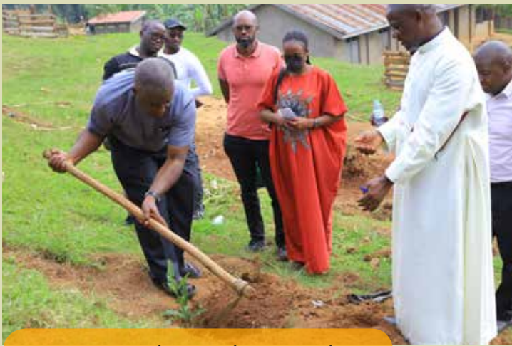
AMDA chaplain planting a tree in Nyakitoko