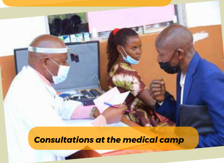
Consultations at the medical camp