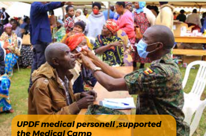
UPDF medical personell ,supported the Medical Camp