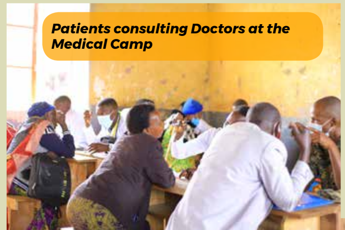
Patients consulting Doctors at the Medical Camp