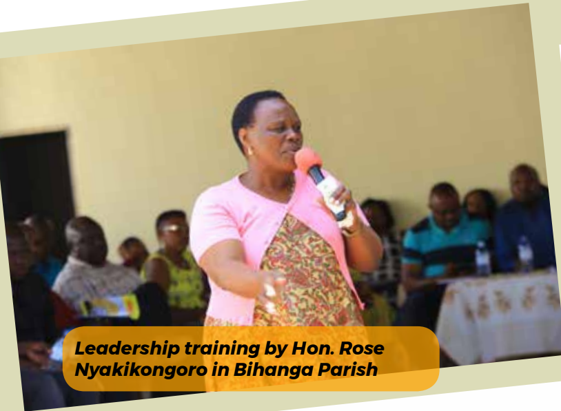
Leadership training by Hon. Rose Nyakikongoro in Bihanga Parish