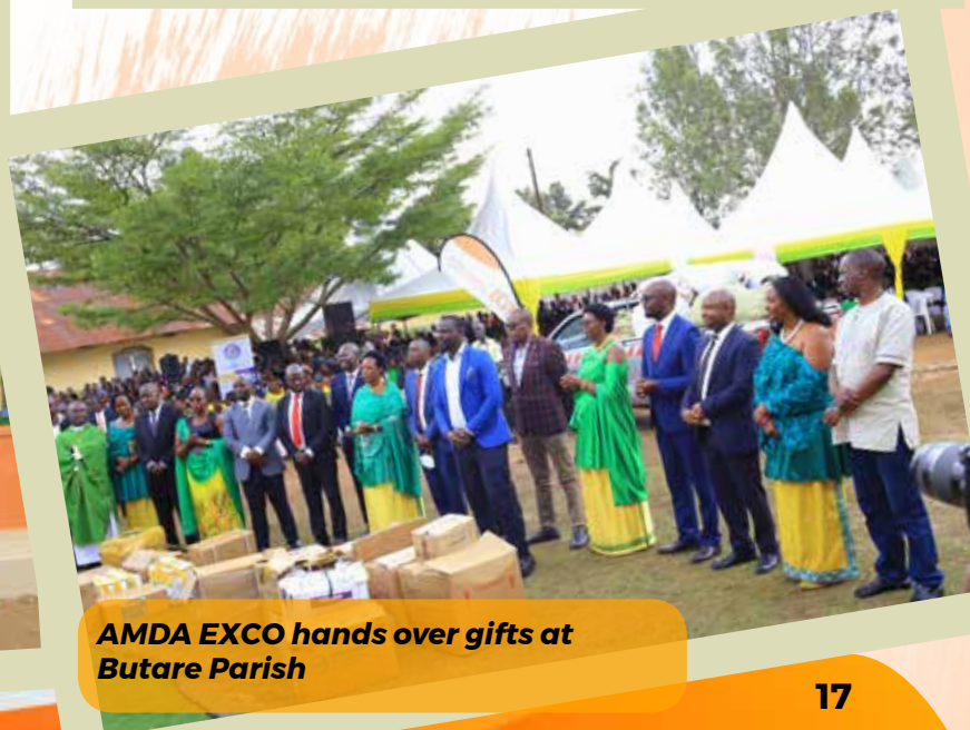
AMDA EXCO hands over gifts at Butare Parish