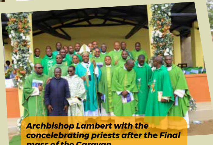
Archbishop Lambert with the concelebrating priests after the Final mass of the Caravan