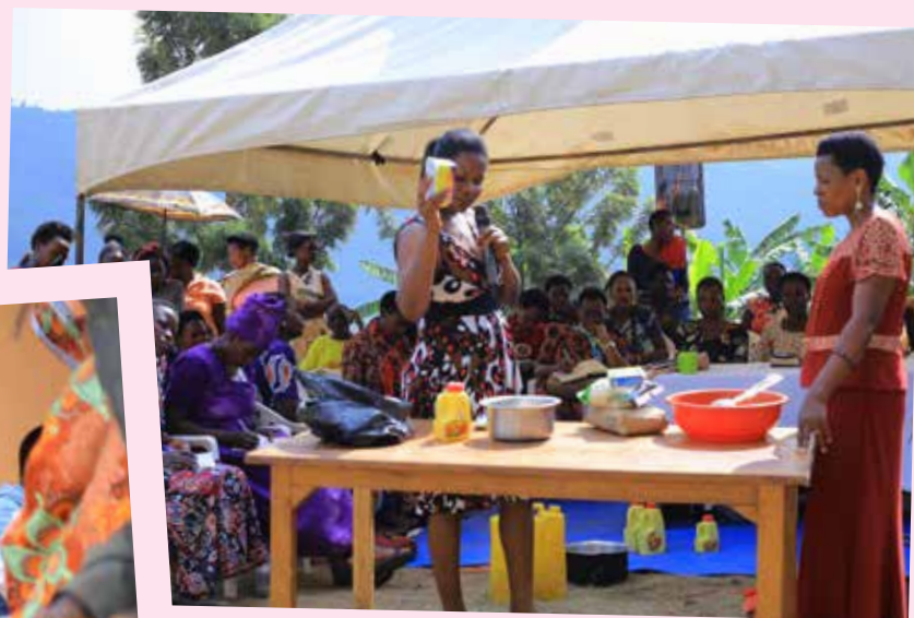
↑ Giving practical skills training on making simple snacks such as mandazi