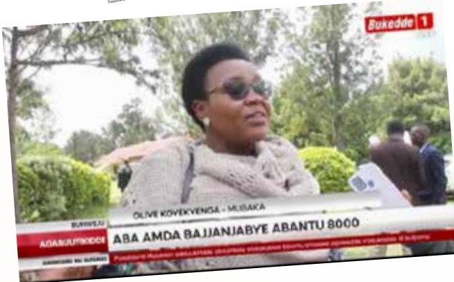
Thousands attend Buhweju Medical Camp