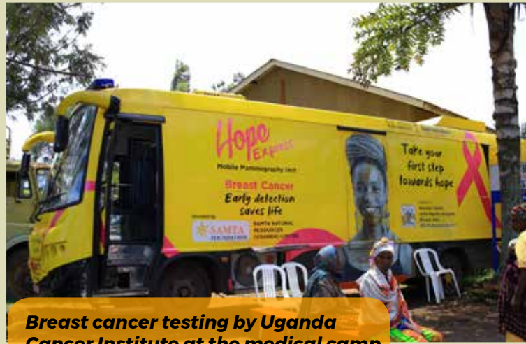
Breast cancer testing by Uganda Cancer Institute at the medical camp