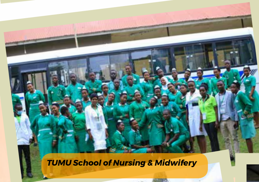
TUMU School of Nursing & Midwifery