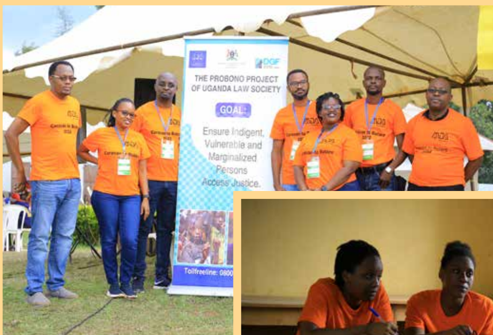
A few of the members of the AMDA Legal team pose for a photograph at the Probono Clinic tent